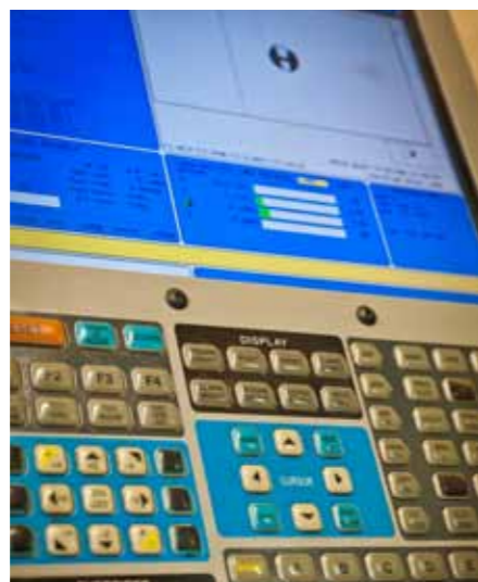
► Mill alone represents £40k of investment

good example. They're interchangeable with the original part, but they're tougher, lighter and they're coated with diamond-like carbon, which is as tough and as slippery as glass. They're recognisably still Manx valve pushers but they're better, taking a little friction out of the valvetrain.