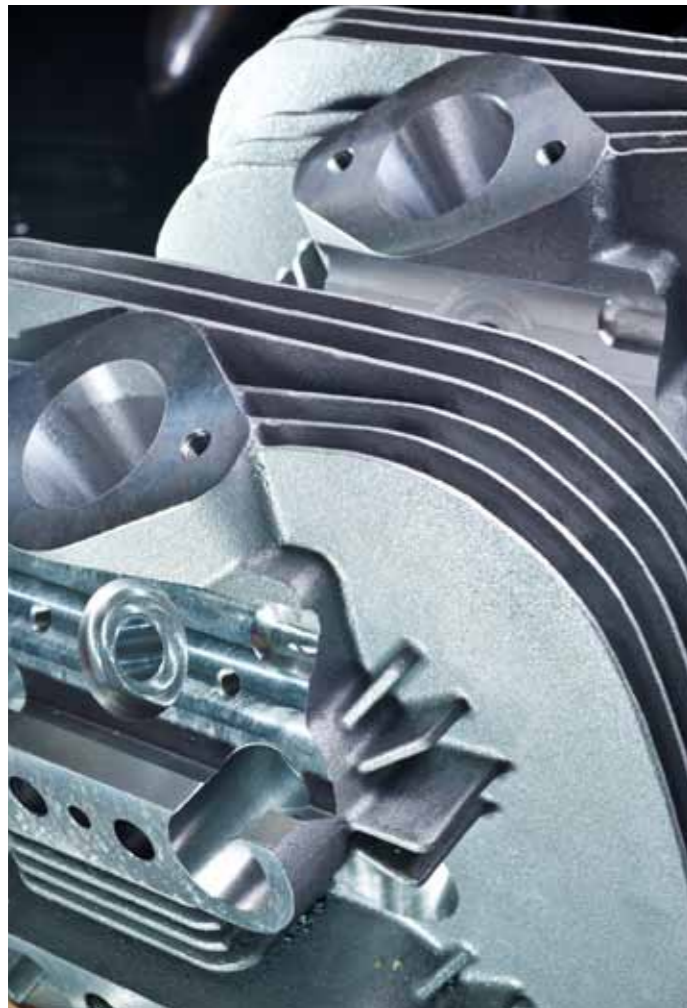
► Heads during machining. Like Turner Prize-winning art, only useful