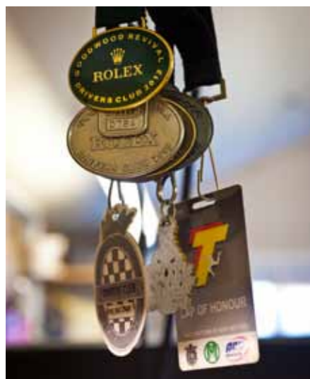
► Works Racing was born at the Revival