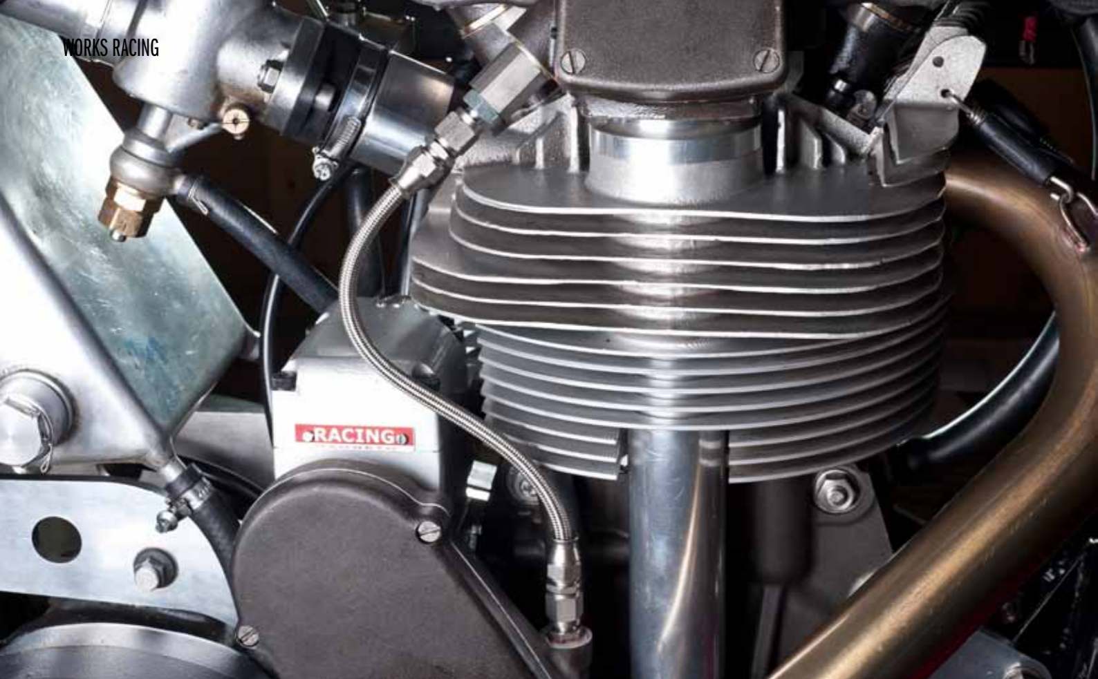
► Note Works Racing's own exhaust, the machined-from-solid barrel, updated Norton logo on the bevel cover and the utter absence of oil mess